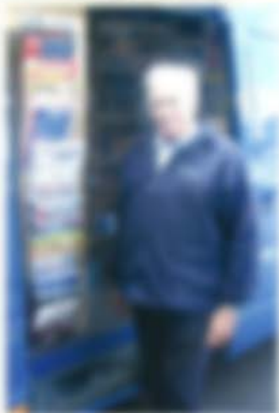
Melksham Motor Spares Consumables Van

Working out of a Melksham Motor Spares van, the company has been able to provide a complete service to the Melksham area, meeting with customers.